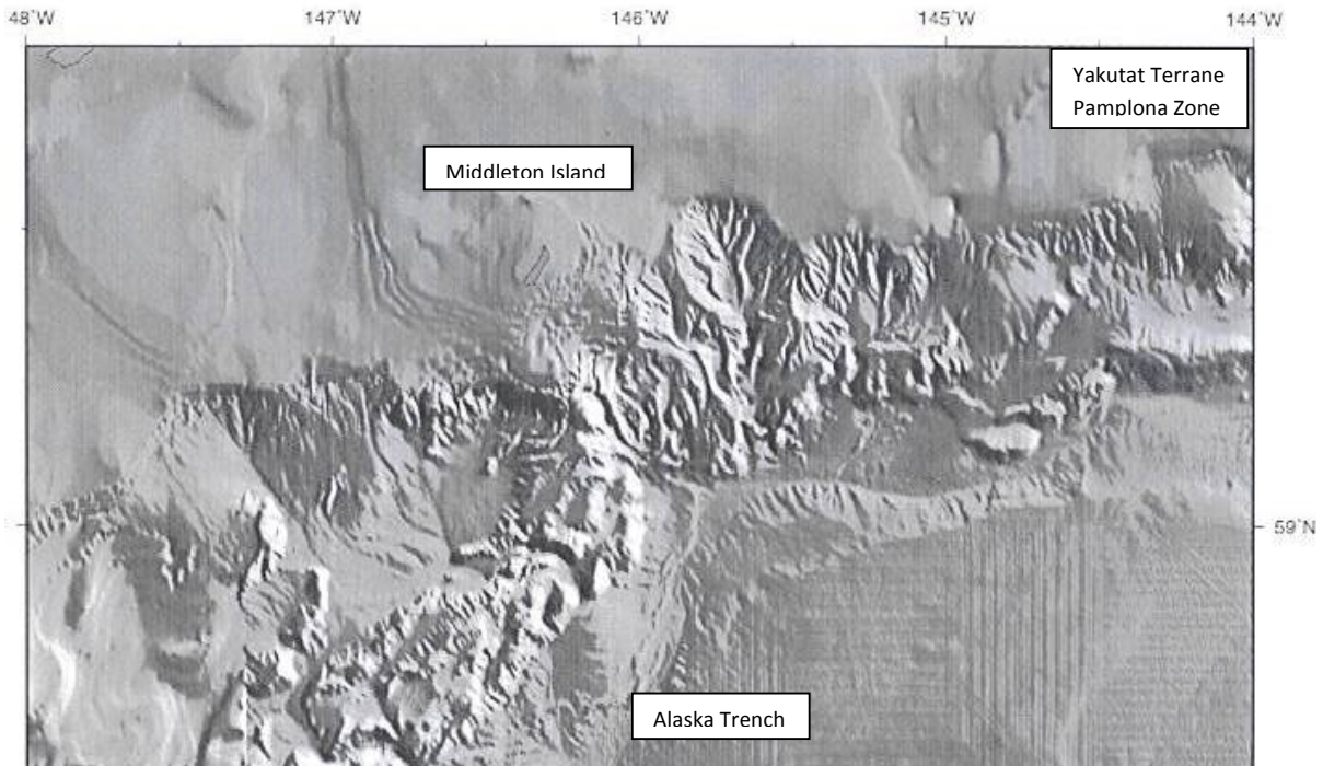
Fig. 1 Slide scars on the continental slope where the Yakutat Terrane trailing flank subducts. Multibeam and conventional bathymetric images are combined. The vertical axis is ~ 200km